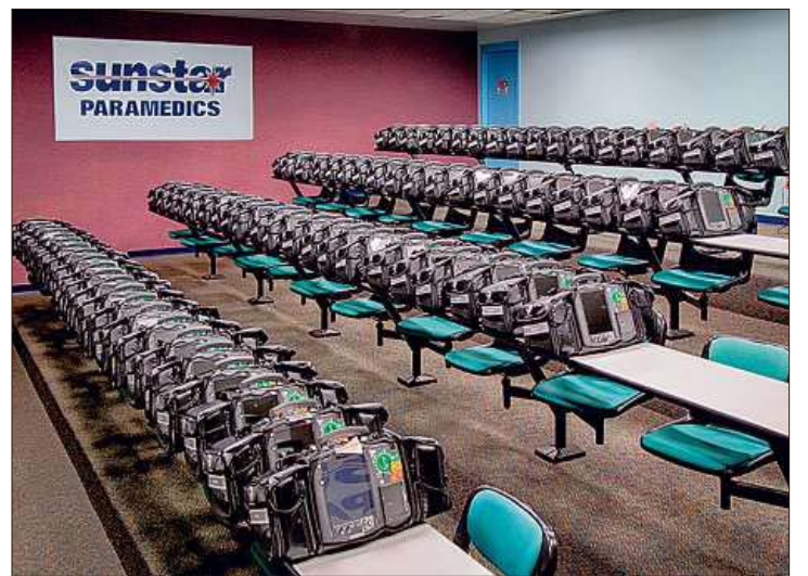
New Philips HeartStart MRx ECG monitors/defibrillators are now in use by the Pinellas County emergency medical services system, including Sunstar Paramedic ambulances.

Sunstar, the 911 ambulance transport service for all Pinellas County residents, employs 550 local residents, and responds to around 500 calls a day. The organization is also a recipient of the Florida Governor’s Sterling Award, recognizing role models for organizational